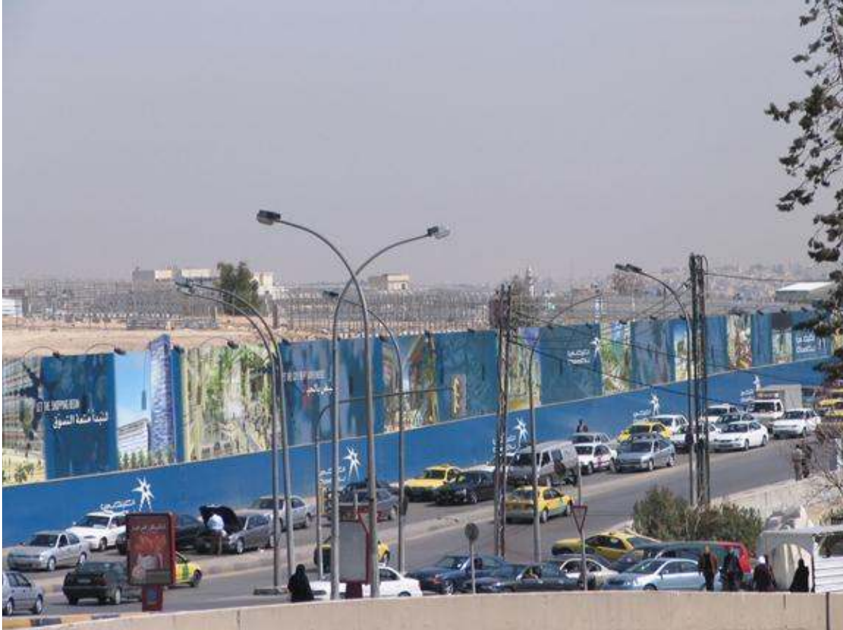
Fig. 1 - A stretch of billboards around the Abdali site during its early stages of construction some 4 years ago.

a non-existent concept in the city until the 2000s, six malls have opened up in Damascus between 2001 and 2009 and 14 others have been announced.