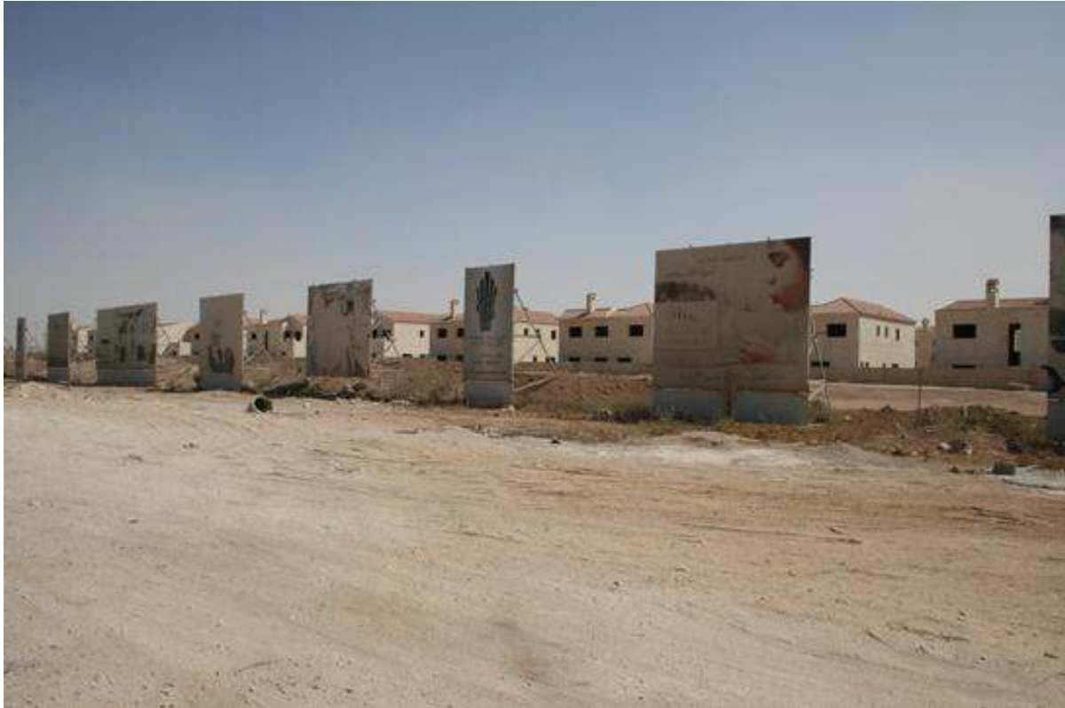
Fig. 2 - The gated community site of Andalusia on the Airport Highway.

According to Chan and Lee (2008) (quoted in Mac & Peacock, 2011, p. 4–5), in order for urban developments to be socially sustainable, they must create a harmonious living environment, reduce social inequality and divides, and improve quality of life in general. Moreover, they identify six criteria for evaluating whether social sustainability has been achieved: provision of social infrastructure, accessibility, availability of jobs, possibility to meet psychological needs, townscape design, and preservation of local characteristics. In their study, the researchers conducted a questionnaire survey in Hong Kong through which they collected and evaluated the opinions of architects, planners, property development managers and local citizens. The responses confirmed