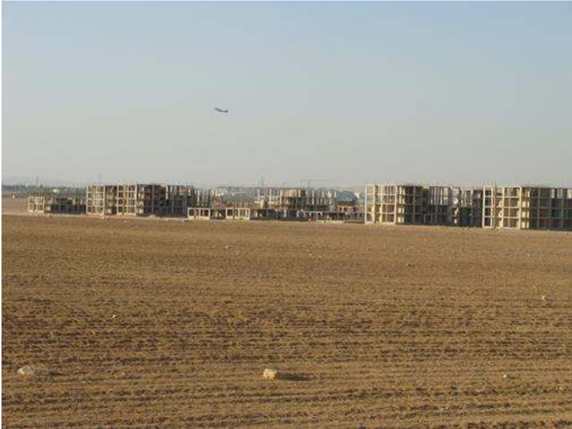
Fig. 3 - The low-income housing project at al Jizza. The building of the newly construction international airport are in the background.

that the researchers' six criteria are indeed significant underlying factors for enhancing social sustainability of local urban development projects.